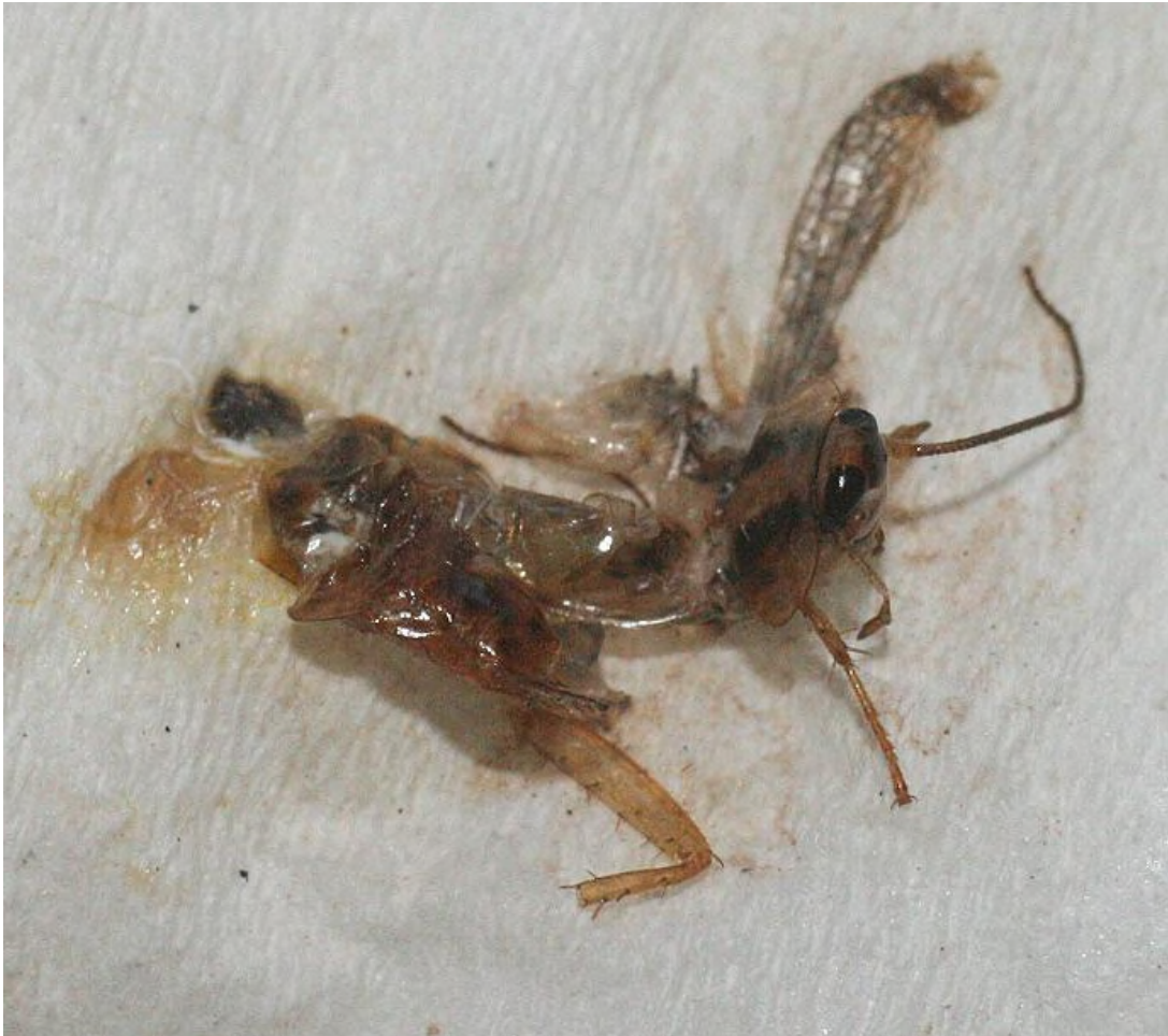
Meet Fred, the Dairy Queen Cockroach!